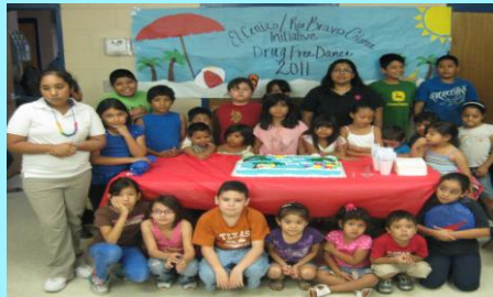
Youth of El Cenizo enjoying a drug-free celebration